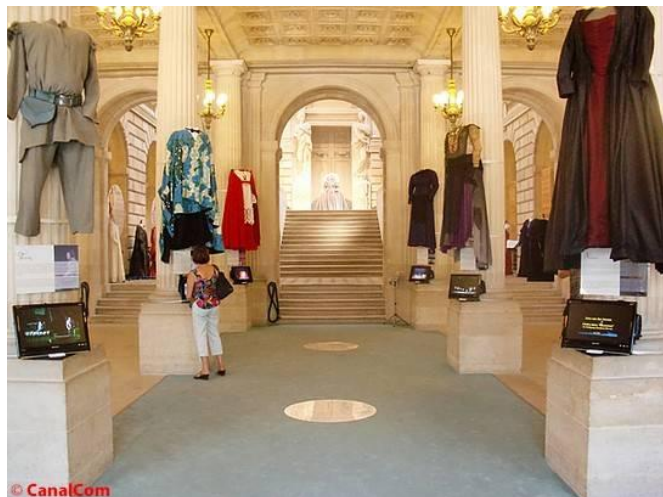
2010 archive photo

This exhibition has been made possible by loans from opera houses abroad and will be open from Monday to Saturday, 12.00 - 18.30, until 31 August.